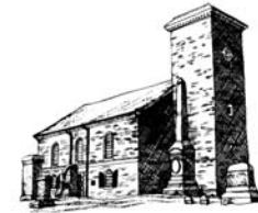
Old Stone Fort Museum Complex